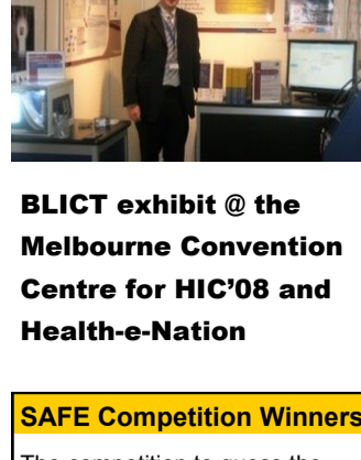
BLICT exhibit @ the Melbourne Convention Centre for HIC'08 and Health-e-Nation